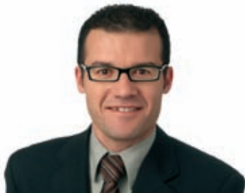
Sergi de los Rios i Martínez Deputy Mayor for City Promotion and Strategies and Promotion Abroad